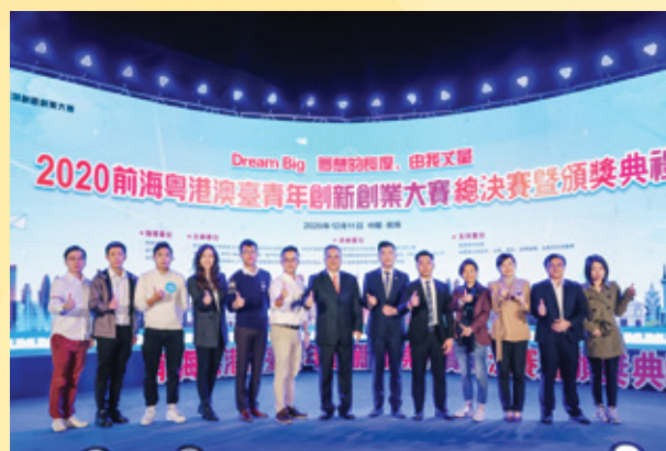
Group photo of teams from the Macao competition zone