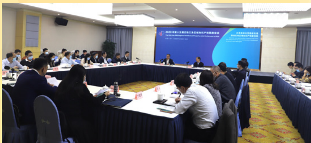
The 15th Pan-Pearl River Delta Intellectual Property Cooperation Joint Conference