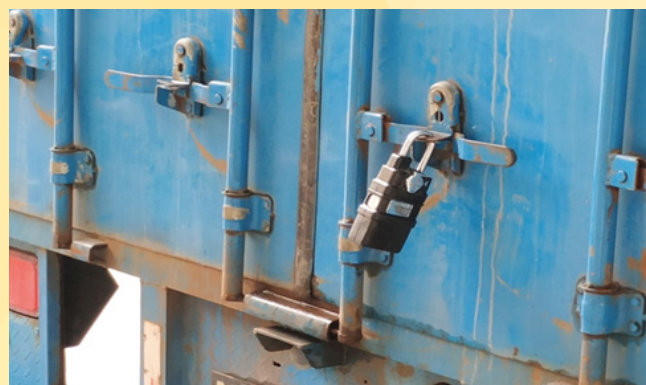
Smart customs lock device

pushed by the relevant working group since the signing of the CEPA Agreement on Trade in Goods on 12 December 2018, the launch of the scheme was agreed in September 2019 after rounds of consultations held in Beijing between the DSE and the SA and the Ministry of Commerce and the General Administration of Customs of the People's Republic of China. The implementation of the scheme allows the customs of the two places to monitor loaded cross-border goods vehicles throughout their trips with a smart customs lock equipped with satellite positioning, so as to achieve automatic express inspection and release for customs clearance for vehicles and their cargoes at customs checkpoints and reduce repeated inspections for the same cargo. This will speed up the flow of cargoes, and in turn enhance the competitiveness of traders by reducing the delivery time of cargo.