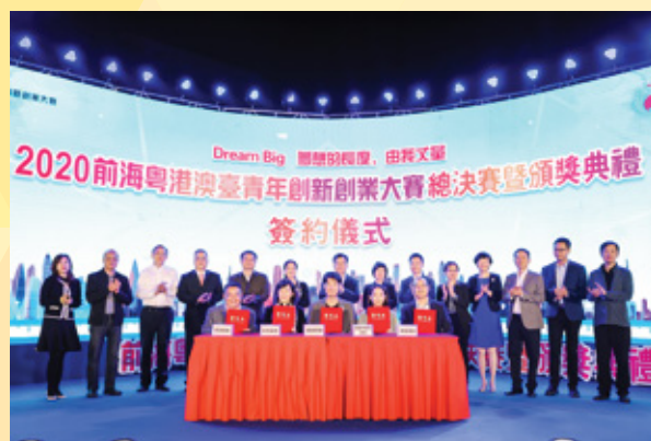
Gold prize awardees sign intents to invest with investors