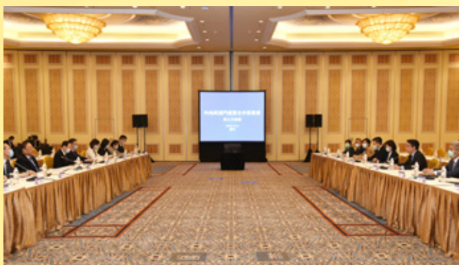
The third meeting of the Mainland and Macao Economic and Trade Cooperation Committee

He offered three suggestions for the orientation of the next step of cooperation of the Mainland and Macao Economic and Trade