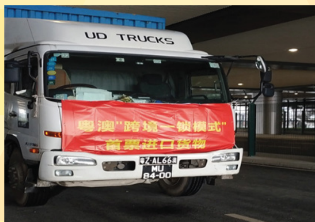
The first consignment of cargo under the Single E-lock