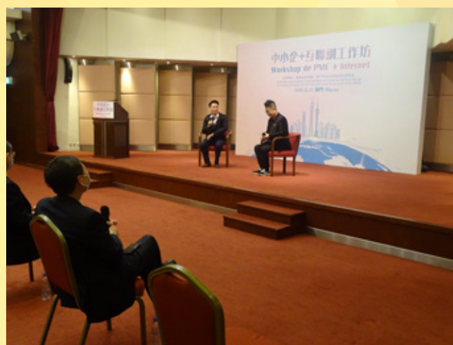
Interaction and exchange session