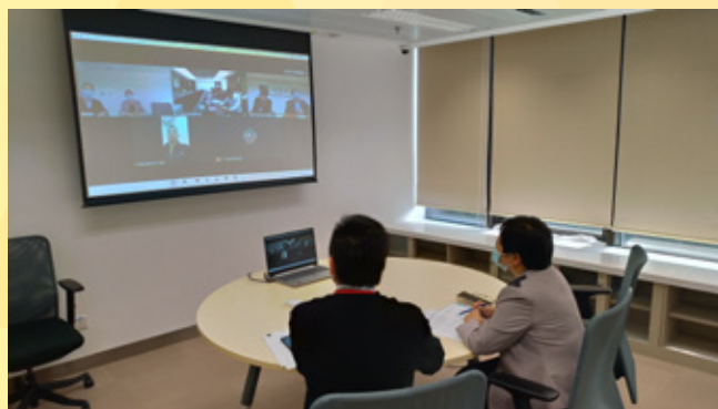
GBA Standardization Research Seminar

The seminar was held for the first time by Guangdong, Hong Kong and Macao for the development of standardization in the GBA, and was anchored by the GBA Standardization Research Center. This meeting was mainly for soliciting the views of Hong Kong and Macao, so as to form consensus for the joint promotion of the GBA’s standardization development by the three places. In the future, Macao will strengthen the exchanges and cooperation with the Center and work with the development of standardization in the GBA.