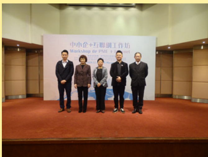
The "SME + Internet Workshop" jointly organized by the DSE and the Department of Commerce of Guangdong Province is held successfully

This workshop saw the participation of a total of some 80 representatives of F&B industry associations and enterprises of the two places, who actively engaged themselves in the interaction and exchange session. The event helps the industry to acquire a deeper understanding of the development trend of the Mainland's F&B industry and inspire local F&B businesses to make good use of internet technologies to develop business.