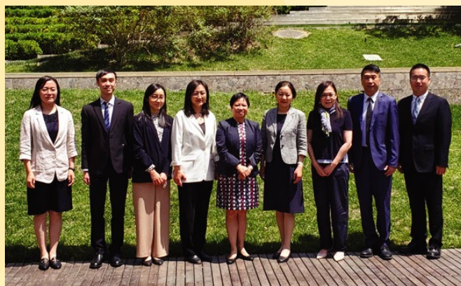
Members of the DSED visit the CNIPA's Patent Examination Cooperation (Beijing) Center