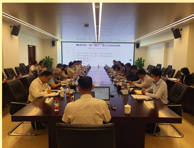
The third Guangdong-Macao “Single Window” working meeting is held in late April

short-term, so as to actively implement the development of “Single Window” for Guangdong-Macao cargo trade.