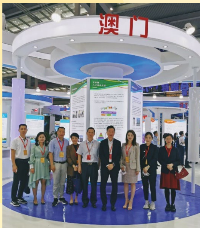
Photo of representatives of Macao and technology-related agencies of Guangdong and Zhuhai taken in front of the Macao booth