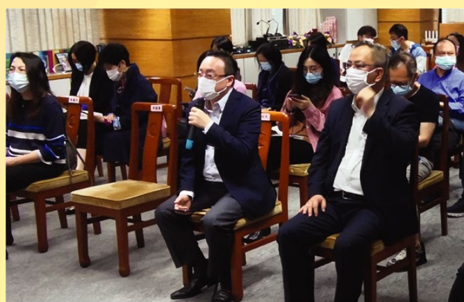
Participating enterprise representatives ask questions actively