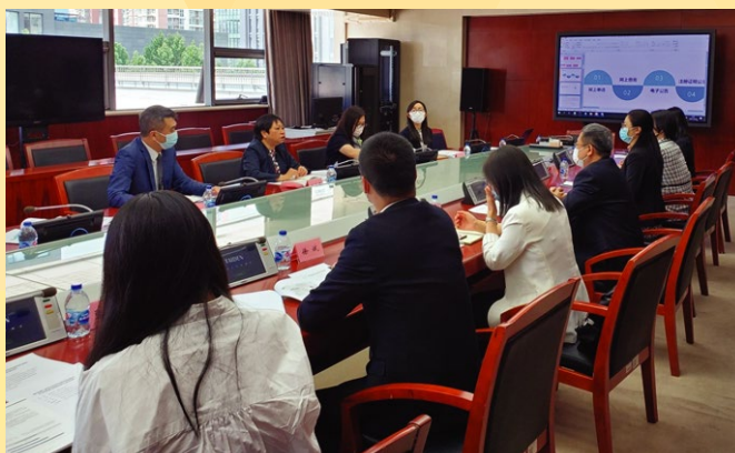
Work exchange between members of the DSED and representatives of the CNIPA's Trademark Office