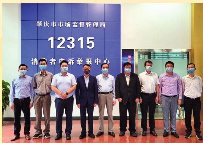
Photo taken after the meeting between the DSED and CC and Zhaoqing's Administration for Market Regulation, Municipal Housing and Urban-Rural Development Bureau and Consumer Council