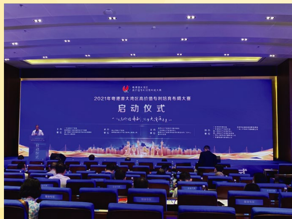
Venue of the Guangdong-Hong Kong-Macao Greater Bay Area High Value Patent Portfolio Contest 2021