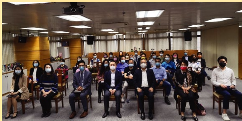
The DSED and the Industrial Association of Macau co-host a briefing session for the industry and commerce sector to present the new legislation