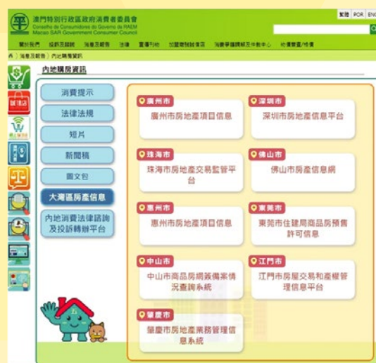
The CC website contains the information about real estate transaction of the 9 GBA cities