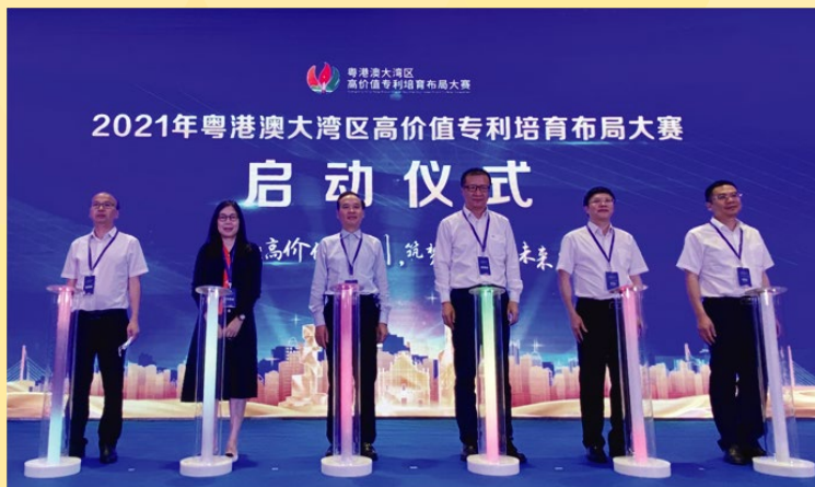
Launch ceremony of the Guangdong-Hong Kong-Macao Greater Bay Area High Value Patent Portfolio Contest 2021