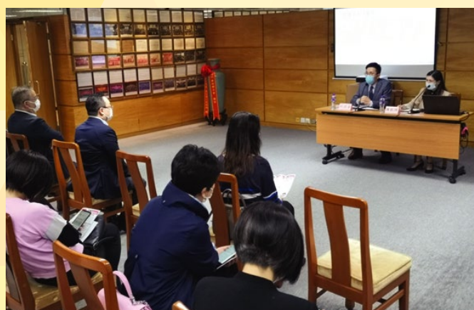
Representatives of the DSED address the questions of attendees in detail