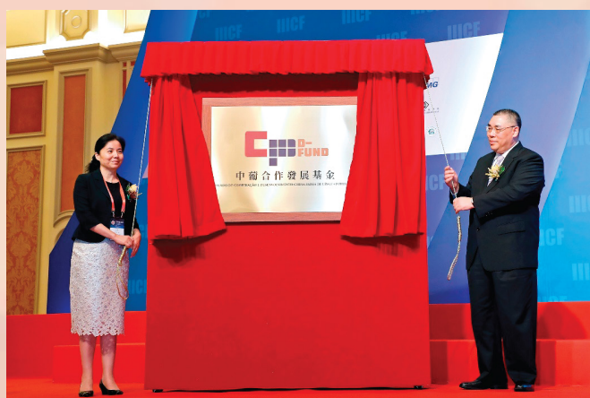
Chief Executive CHUI Sai On unveils the plaque of the China-Portuguese Speaking Countries Cooperation and Development Fund