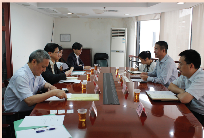
Working meeting between the delegates of the two sides

Guangdong Province in the afternoon of the same day, discussing on the major tasks of the next stage of Guangdong-Macao service industry cooperation.