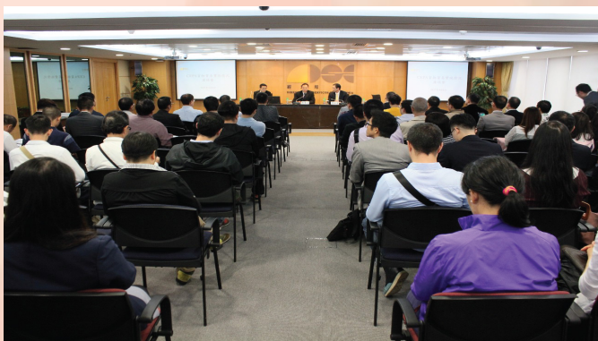
DSE Seminar on the Implementation of CEPA Trade in Goods