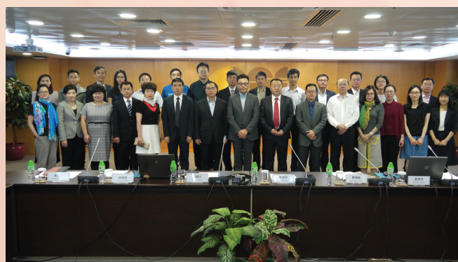
Group photo of the Macao and Hong Kong representatives

Jointly organized by the Macao Economic Services (DSE) and the Intellectual Property Department (IPD) of Hong Kong SAR Government, the “Pan Pearl River Delta Staff Exchange Program” was held between 24 May and 26 May, with the aim to enhance the mutual understanding among public officials in the Pan Pearl River Delta (PPRD) of each other’s intellectual property (IP)-related work, and to foster cooperation and exchange in IP protection.