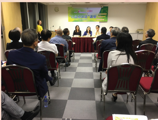
Seminar on “Food Labeling Law”

know, the information of all pre- and non-pre-packed foods must be displayed in accordance with the Law. It was generally concurred by the participants that the seminar has helped to improve the understanding of the Law among their industries and enhanced their sense of compliance.