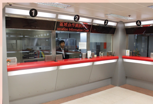
Regional Cooperation Information Center

The Agreement on Trade in Services under the framework of the Mainland and Macao Closer Economic Partnership Arrangement (CEPA) (hereinafter referred to as the “Agreement”) is officially implemented on 1 June 2016. After the implementation of the Agreement, the Mainland has opened up 153 services trade sub-sectors to the Macao services industry. The Agreement is the first free trade agreement which liberalizes trade in services to the entire Mainland with market access provisions for national treatment and the management approach of negative listings. It also re-states the existing liberalization content under CEPA and its Supplements, signifying the basic liberalization of trade in services between the whole Mainland and Macao.