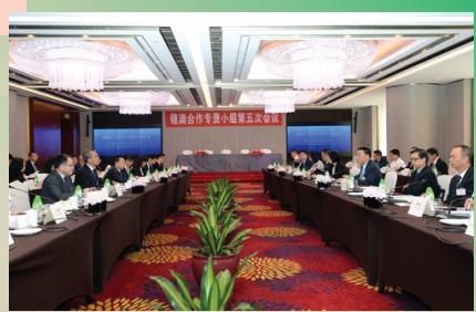
2016 Guangzhou-Macao Cooperation Task Force meeting