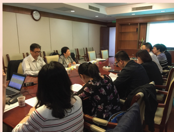
Macao CEPA consultation on the rules of origin for the first half of 2016

The rule of origin of above mentioned products and respective tariff code are available for download on the website of Macao Economic Services (Website: http://www.economia.gov.mo/zh_TW/web/public/pg_cep_a_tig?refresh=true ). The Zero-Tariff treatment measure of Trade in Goods of CEPA has been implemented since 2004, as of the first half of 2016, total number of Macao products eligible for the zero-tariff treatment has reached 1,458, total export value of CEPA products reached MOP708 million, involving an estimate tariff saving amounting to MOP53.48 million.