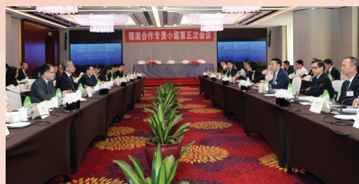
2016 Guangzhou-Macao Cooperation Task Force meeting held in Guangzhou