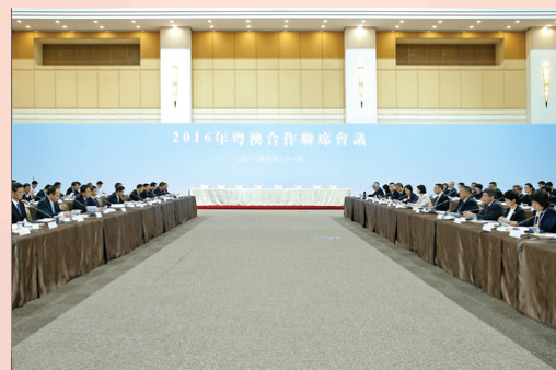
2016 Guangdong-Macao Cooperation Joint Conference held in Macao East Asia Games Dome

2016 Guangdong-Macao Cooperation Joint Conference was held in Macao. Both sides affirmed the deep development and sustainable achievement on the Guangdong-Macao cooperation in the last year. The governments of Guangdong and Macao started the annual key work of “Framework Agreement of Macao-Guangdong Cooperation”, which helps promoting the economic development and improving the livelihood in the two places.