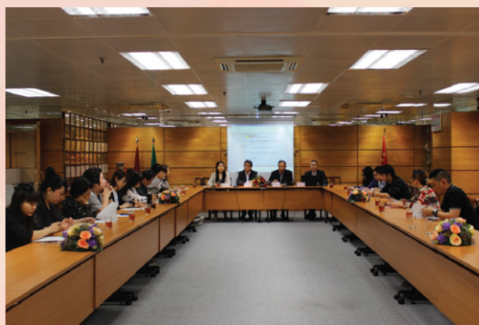
DSE representative introduce the electronic measures of Certificate of Origin (CEPA)

To promote the electronic work of certificate of origin (CEPA) and further facilitate the trade in goods between the Mainland and Macao, after negotiation between two places, Macao Economic Services issues certificate of origin (CEPA) in electronic form starting from 1 May, 2016 onwards. Local enterprises only need to submit application to DSE, after completion of relevant procedures, DSE will issue the certificate of origin (CEPA) in electronic form while related data of goods will be transmitted to the Mainland Customs at the same time. The number of declared goods of each certificate is increased to a maximum of 20.