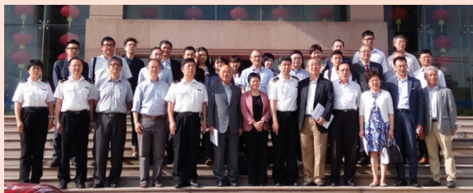
Macao Economic Services and local industry representatives participated in the Macao CEPA Enterprises Forum

Macao Economic Services is endeavoured to promote the zero-tariff measures of CEPA for better utilization for enterprises. In order to strengthen exchange and communication between industries and related departments of Mainland, Macao Economic Services organized a delegation of more than 30 industry representatives to participate in the “Macao CEPA Enterprises Forum” held in Gongbei Customs on 31 May 2016, assisting