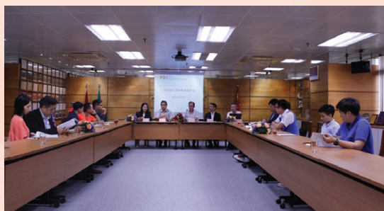
Macao Economic Services held Seminar on “Trade in Goods of CEPA”

In order to encourage the industries to better utilize the zero tariff measures of CEPA, and to understand the latest situation of Trade in Goods of CEPA, Macao Economic Services held the Seminar on “Trade in Goods of CEPA” at Industrial Association of Macao on 16 June 2016, the seminar introduced 134 additional and 3 revised rules of origin for CEPA products, and related application procedures.