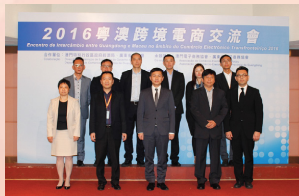
Seminar on cross-border e-commerce of Macao and Guangdong 2016

“Seminar on cross-border e-commerce of Macao and Guangdong” was held on 14 April, which was supported by Macao Economic Services and Department of Commerce of Guangdong Province, co-organized by E-Commerce Association of Guangdong and E-Commerce Association of Macau. The seminar was a key task of Guangdong-Macao Cooperation on Services this year, and also an implementation work of the "Memorandum on Strengthening Cooperation of Cross-border E-Commerce Trade" which was signed by Macao Economic Services and Department of Commerce of Guangdong Province last year. The seminar aimed at establishing a platform for Guangdong and Macao cross-border e-commerce or local industries or citizens who have intention to establish cross-border e-commerce business, especially youth entrepreneur who engaged in cross-border e-commerce.