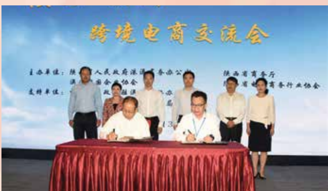
The CBEC Sub-committee of the Macau Chinese Enterprises Association signs a strategic cooperation agreement with the Shaanxi E-commerce Association