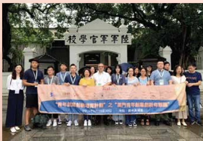
The Macao youth entrepreneurship representatives' group visit the Whampoa Military Academy

series of policies, hoping that youths of Macao engaging in innovation and entrepreneurship would settle in there for development. The Implementation Measures for Supporting the Innovation and Entrepreneurship of Hong Kong and Macao Youths supports youths from Hong Kong and Macao in settling in for development in various aspects, such as entrepreneurship commencement, innovation incentives, platform development, financial support, working subsidies, internship and employment, as well as cooperation and exchange, with a view to jointly creating a bright future of development.