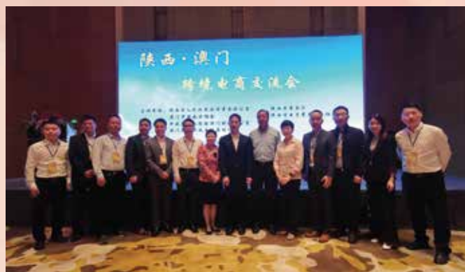
Representatives of Macao participate in the Shaanxi-Macao CBEC Exchange Seminar