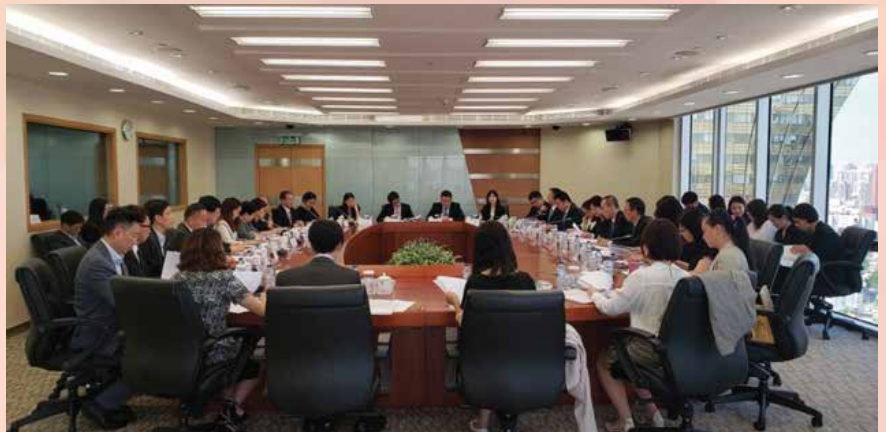
This year's 3rd SOM of the CEPA Joint Steering Committee convenes in Macao

The meeting was attended by representatives of a number of authorities, among others, the Macao Economic Bureau, the Monetary Authority of Macao, the Macao Trade and Investment Promotion Institute, the Legal Affairs Bureau, the Cultural Affairs Bureau, the Land, Public works and Transport Bureau, the Macao Post and Telecommunications Bureau, and the Higher Education Bureau.