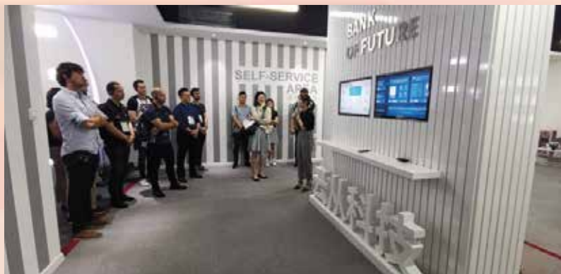
Visit to a well-known technology enterprise in Guangzhou engaging in facial recognition and big data technologies

projects covered innovation and technology fields such as artificial intelligence, big data, internet of things, big health, marine organisms and clean energy, etc. The staging of roadshows on one hand allowed the youth startups from PSCs to interact and exchange with Mainland investors, venture funds and relevant technology enterprises for receiving expert comments and improvement suggestions and facilitating establishment of business connections. On the other hand, it favors Macao in giving full play to its function as a platform between China and PSCs for introducing quality technology startup projects from PSCs to develop business in the GBA, which will assist in China’s innovation and entrepreneurship development, and allow Macao integrate better into China’s major development strategies such as the GBA and “Belt and Road” Initiative.