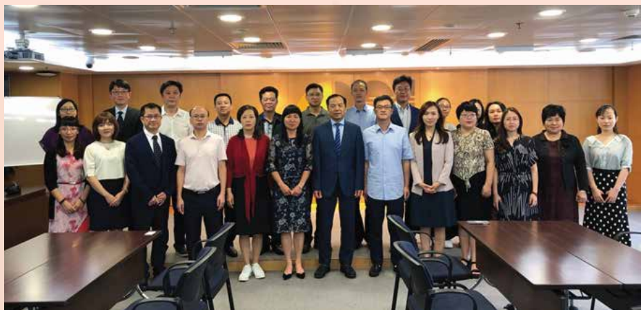
Group photo of the attendees

discussions, they visited the Macao University of Science and Technology to learn about Macao’s scientific research capabilities, academic level and higher education development. The discussions and visits enabled a comprehensive understanding of the IP protection work of the SARs of Hong Kong and Macao, and deepened the mutual understanding among the PPRD region.