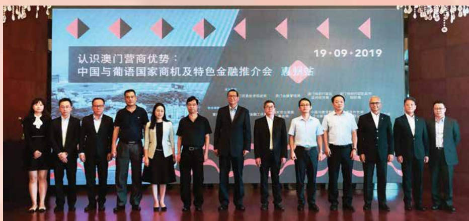
China and PSCs Business Opportunities and Featured Finance Promotion Session

(CPDFund), the Session also highlighted the newly-enacted Legal Regime of Financial Leasing Companies and Tax Incentives Regime for Financial Leasing Companies. The Promotion Session has finished touring nine cities in the GBA and achieved the expected result, deepening the understanding of Macao among the GBA cities, especially in terms of Macao’s role as a platform between China and PSCs and its financial development.