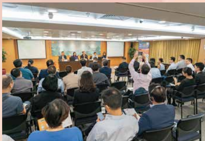
Industry representatives raised questions actively at the briefing session

information of various aspects, such as the operation process of the KPCS and the requirements for engaging in the business, among others, the DSE held a briefing session on the Law on 17 September. The session saw representatives of the DSE, the Customs, the Macao Post and Telecommunication Bureau and Macao EDI VAN give in-depth presentations on the requirements of the Law, specifically, process for application for Operating License, Import/Export License and KP Certificate; obligations of operators and penalty regime for violations; customs declaration and clearance processes and procedures; operation process of EDI electronic customs declaration; and notes for application for and use of electronic signature. The session received an active participation of practitioners of the trade.