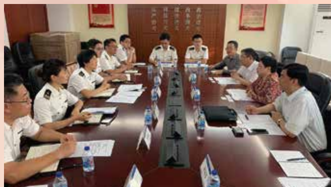
The meeting of WGs convenes under CEPA's Agreement on Trade in Goods

the Macao Economic Bureau, saw the two sides discuss ROO work, food safety monitoring, customs clearance facilitation measures and cooperation in smart customs, among others. Under the framework of CEPA, the two sides had ample discussions on the above issues, explored new trial runs, and sought preferential measures with higher openness with the aim of advancing customs clearance facilitation and promoting the development of local manufacturing industries.