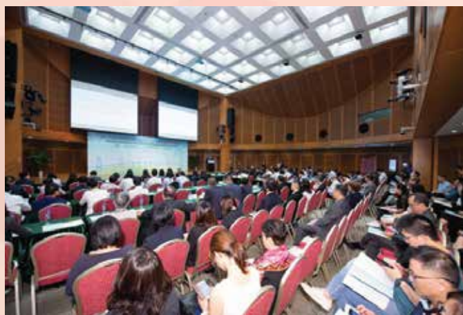
Symposium in progress

The Symposium has been held annually in rotation between the Mainland, Hong Kong and Macao since 2000, and reached its 20th anniversary this year. From its inauguration, the Symposium has provided IP practitioners in the three places a platform for initiating exchanges and strengthening communication, bringing a positive effect to deepening the cooperation and exchange in the IP field between the three places.