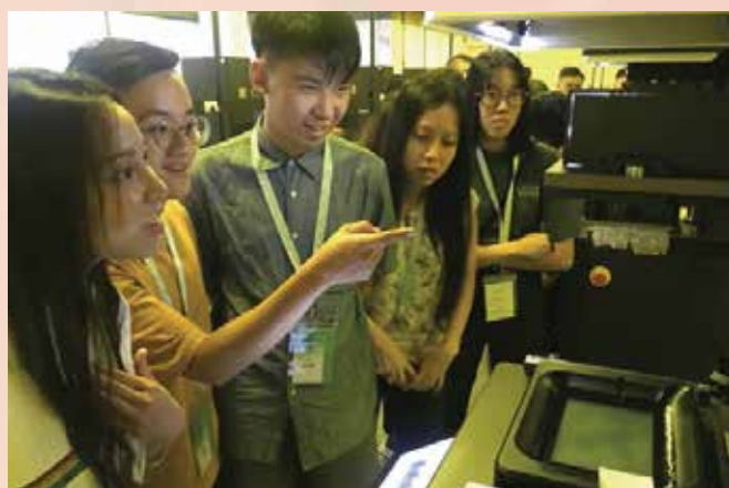
The Macao youth entrepreneurship representatives' group visits high-tech enterprises in Huangpu to feel the frontier technologies