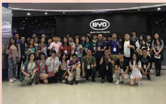
Visit to the BYD plant at Pingshan District, Shenzhen

exchange group visited the BYD plant at Pingshan District, Shenzhen, where they experienced a trial ride on the cloud rail train and the facial recognition entry and exit system to feel the convenience brought to life by innovative technologies. Meanwhile, to strengthen the youth's understanding of China's modernization development, the Macao youth exchange group visited the "Great Tides Surge Along the Pearl River – 40 Years of Reform and Opening-up in Guangdong" exhibition for strengthening their national sentiment and patriotism and better integration into the national development strategies.