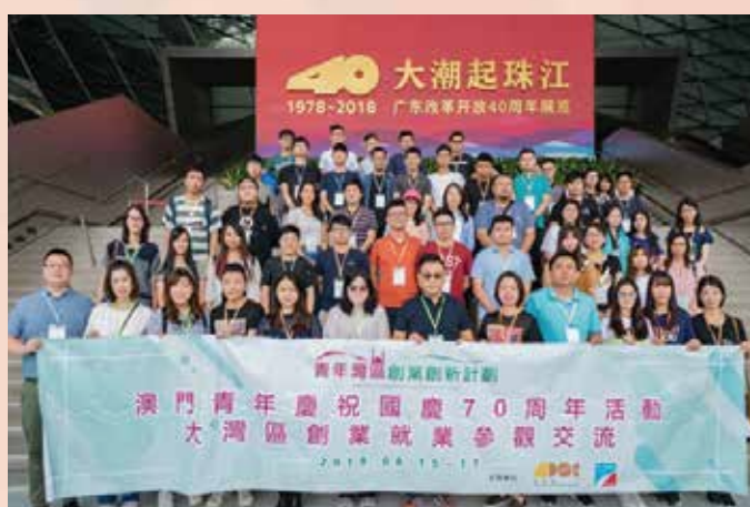
Visit to the "Great Tides Surge Along the Pearl River – 40 Years of Reform and Opening-up in Guangdong" exhibition