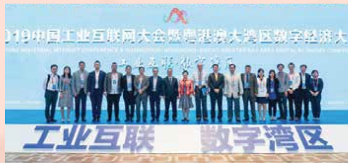
Group photo of members of the Macao delegation at the Conference venue

Themed “Interconnection of Industries, A Digital Bay Area”, the Conference facilitated integration of innovation elements of digital economy, focused on digital industrialization and industrial digitalization and promoted the innovative application of industrial internet and the development of new technology and industries in support of the development of the GBA Digital Economy Pilot Zone. Apart from the main forum, the Conference also included the Greater Bay Area Conference on Robotics and Artificial Intelligence, the 2019 Guangdong-Hong Kong-Macao Big Data Application and Innovation Development Conference, a business exchange and matchmaking seminar, and a 2-day feature exhibition of industrial Internet application scenarios, where outstanding industrial internet platforms and service providers in China and overseas staged displays. Furthermore, Guangdong, Hong Kong and Macao jointly