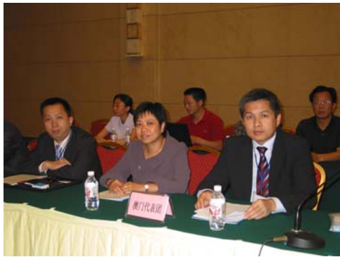
Representatives from Macao Economic Services and Macao Custom Services, attended the 3 rd Pan Pearl River Delta Region Intellectual Property Rights Cooperation Forum and the Joint Committee Meeting.