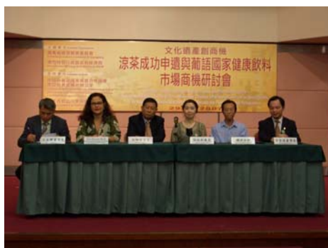
Speakers of the Seminar were answering questions raised by participants.

Participants of the Seminar pointed out that, cultural departments of Macao, Hong Kong and Guangdong reached consensus on recognizing Chinese herbal teas as national Food Cultural Heritage in February 2006, and hence the governments in the three places applied to the State Council to inscribe Chinese herbal teas as National Immaterial Cultural Heritage. In May of the same year, the State Council approved and declared Chinese herbal teas to be listed as National Immaterial Cultural Heritage. Meanwhile, 21 Chinese herbal tea producers in Guangdong, Hong Kong and Macao, 18 herbal tea brands and 54 herbal tea formulas and terminologies are now protected under relevant laws and regulations.