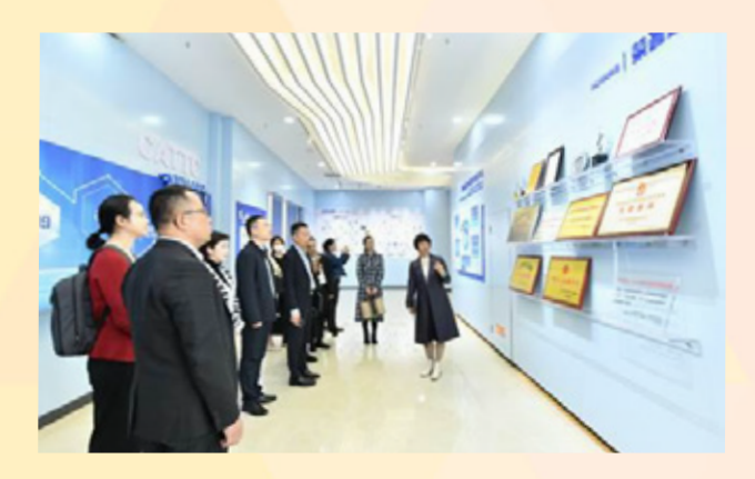
Visiting the CATTC at Nanning, Guangxi