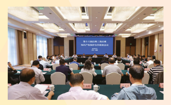
The 16<sup>th</sup> Pan-Pearl River Delta Intellectual Property Cooperation Joint Conference

During the conference, the representatives discussed enhancing full-chain IP protection, strengthening development of joint IP protection system, promoting external exchange and cultivation of talents, improving IP service system, and strengthening IP protection information resource sharing within the region, among other work areas.