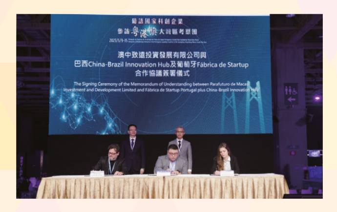
Incubators of Macao, Portugal and Brazil sign a cooperation agreement at the event

of Macao, and a Portuguese I&T enterprise signed a cooperation agreement with a tertiary institution of Macao. The attending enterprises considered the event effective and were confident in exploring the Mainland market. They hoped to obtain more relevant information from this visit.