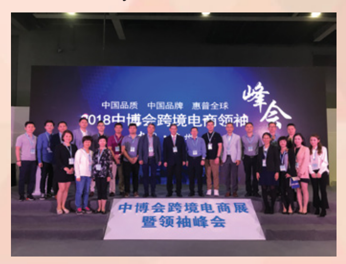
Macao's e-commerce sector attends the Cross-border E-commerce Leaders Summit of the 15th CISMEF

To nurture local e-commerce talents and assist small and medium enterprises in getting a grasp of the latest information of cross-border e-commerce. the Macao Economic Bureau (DSE) organised e-commerce-related associations in Macao to participate in the Cross-border E-commerce Exhibition and Leaders Summit of the 15th China International Small and Medium Enterprises Fair (CISMEF), which was held between 10 and 13 October 2018 at the Poly World Trade Center Expo in Pazhou of Guangzhou, on 11 October in order to help enterprises to understand the development trend and opportunities of cross-border e-commerce in the Mainland and exchange with the industry there.