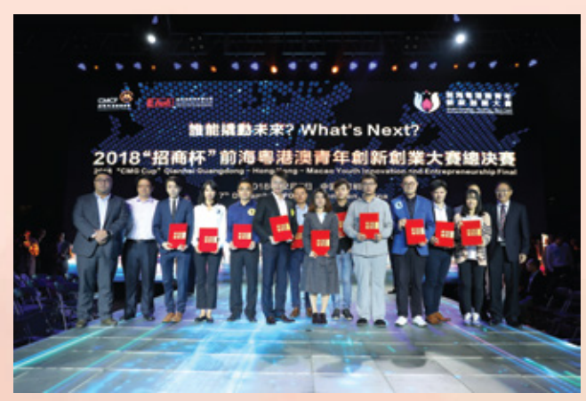
Macao youth entrepreneurship teams win the excellence awards

ceremony held in the evening, each team strived to gain additional points by delivering a one-minute-only elevator pitch and by playing its group VCR, making the process of the activity compact and attractive. Eventually, the nano-silver flexible touch control project of a Macao participating team won the bronze award of the Enterprise Group. Other projects, namely ADot, Macau Spirit, Gathering, Brother Repairs APP and Zhenxi won the excellence awards.