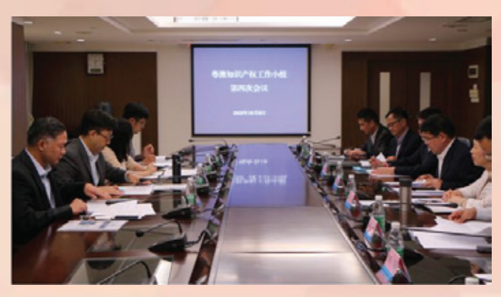
The Guangdong-Macao Intellectual Property Working Group holds its fourth meeting in Guangzhou

With the aim of strengthening the cooperation between exchange and Guangdong and Macao in the different aspects of intellectual property protection, the Guangdong-Macao Intellectual Property Working Group was established on 10 May 2012 following its first meeting convened in Guangzhou. The Group comprises intellectual property administration protection authorities of Guangdong and Macao. Members of the Guangdong side include the Guangdong Intellectual Property Office, the Guangdong Press, Publication, Radio, Film & Television Bureau, the Department of Public Security of Guangdong Guangdong Province, and the Sub-Administration of China Customs: members of the Macao side include the Macao Economic Bureau and the Macao Customs Service.