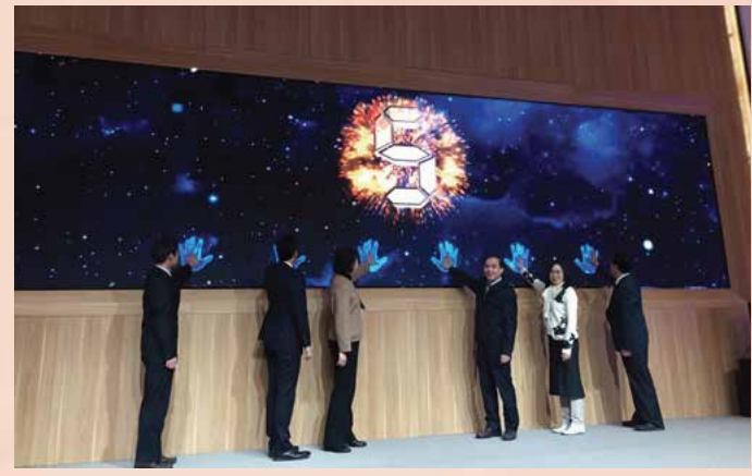
Guangdong-Hong Kong-Macao Greater Bay Area High Value Patent Portfolio Contest 2019 Launch Ceremony

the level of innovative capabilities and high-value patent portfolio building in the Guangdong-Hong Kong-Macao Greater Bay Area with a point-to-plane approach by means of scouting patent innovation projects with advanced technology, big market potential and better built patent value portfolio, so as to accelerate the high-quality development of the Guangdong-Hong Kong-Macao Greater Bay Area.