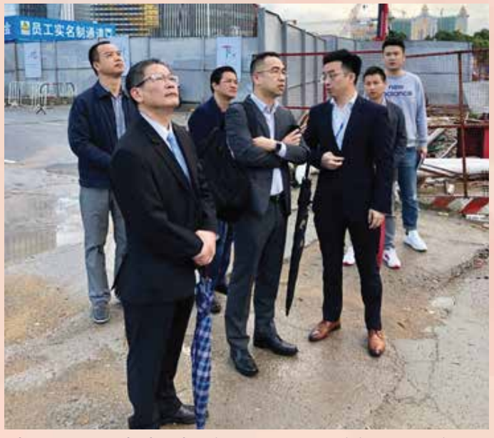
The DSE and the business sector visit Hengqin's cross-border e-commerce support facilities