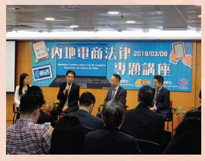
Mainland e-commerce expert conducts exchange with Macao's e-commerce sector