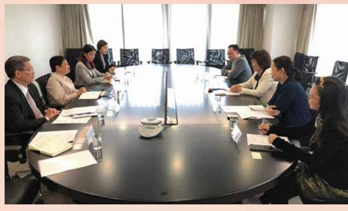
Representatives of Guangdong and Macao attend the working meeting of Guangdong-Macao Services Expert Group convened in Macao

the DSE. The achievement of services sector cooperation between Guangdong and Macao last year was reviewed, and a discussion on the direction and plan of services sector cooperation between the two places in 2019 was held during the meeting. The