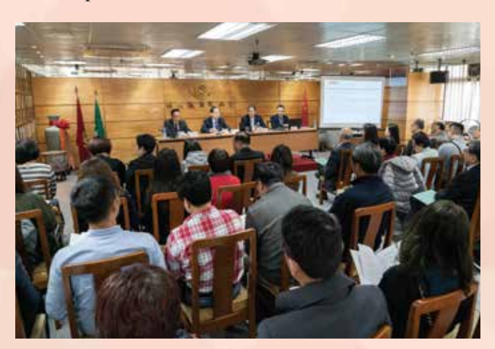
The DSE promotes the CEPA Agreement on Trade in Goods among the business sector

Goods, and encourage more enterprises to export their goods to the Mainland by making use of CEPA's zero-tariff preference policies, so as to propel the development of trade in goods between the two places to a new level.