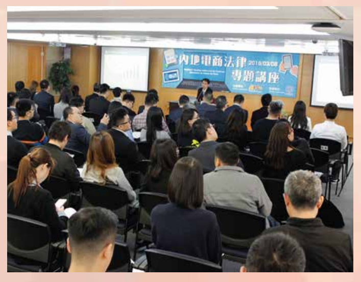
Mainland e-commerce expert interprets the E-Commerce Law for Macao's e-commerce sector

feedback during the Q&A session. Representatives of the sector raised questions regarding the actual impact possibly brought by the implementation of the new law to enterprises. The event did not only deepen the sector's understanding of the development trend of cross-border e-commerce, but also assisted Macao's SMEs in exploring the huge Mainland market. Those who are interested may access the DSE's website or Facebook page (@DSEMacau) for the recording of the talk.